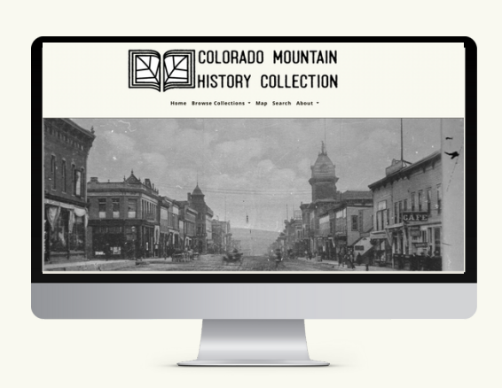
Digital collection goes LIVE!