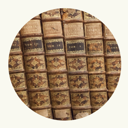
Relevant collection development