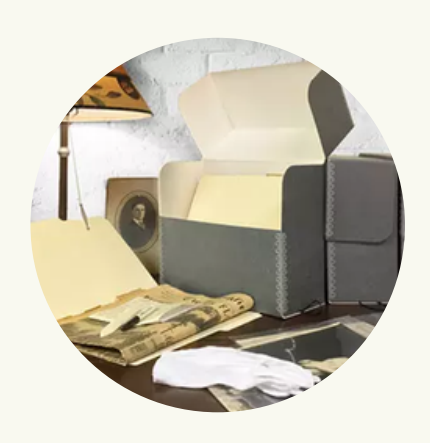
Underwent major improvements in the preservation of our fragile documents