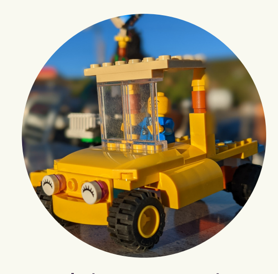
LEGO Club, Lego Robotics & Adult Legos