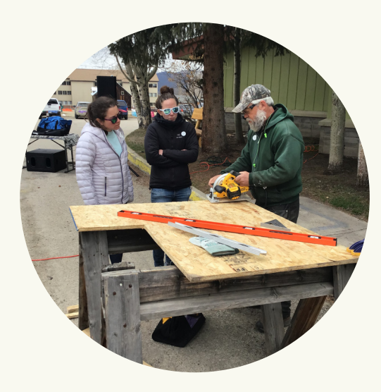
Tools & Tacos